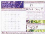
Optional PC Software